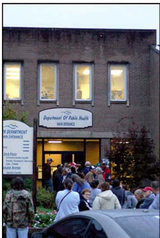
Hundreds lined up prior to the doors opening at 7:00 AM on Friday morning, September 23

and hygienists from across the state to show up and work long