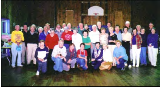
Volunteers for the first outreach

“It all began in 2003, when a few members of the Church of the Good Shepherd decided to address some of the needs of Cashiers’ poorest residents,” she says. “We solicited help from other area churches and put together a three-day outreach program at the Community Center. Volunteers cooked meals, the Methodist church set up clothing racks, the Health Department provided immunizations, and we set up a medical clinic in the Fire Department. We also borrowed the North Carolina Baptists’ Mobile Dental Van and parked it on the grounds. The response exceeded our wildest expectations.”